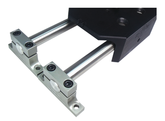
Shafts & Carriage mounted on a pair of shaft supports

Typically two shafts are arranged parallel to each other and supported by four shaft supports. A carriage with installed bearings or bushings is mounted on the shafts allowing the carriage smooth linear motion. The shafts must be accurately aligned parallel to each other or the carriage will not operate smoothly.