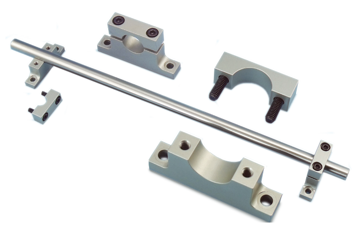
Easy-Access™ shaft supports are available from Ondrives.US in two profiles

Ondrives.US Corp. manufacturers an alternative two piece linear shaft support with a removable top component. It is supplied with 2 cap screws to clamp the shaft down onto the base.